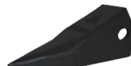
2300C - Tooth Tiger Point