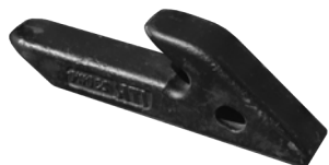
230WO - Short Shank Adapter

Minimize downtime with in-stock inventory of all Arrow bucket accessories.