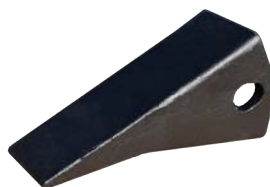
2300 - Tooth Standard