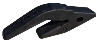
231WO - Long Shank Adapter