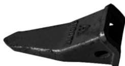
230ST - Tooth Star