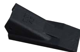
2A - Crimp-On Tooth