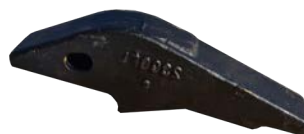
2300FL - Flush-mount Adapter