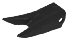
23TW - Tooth Twin Tiger